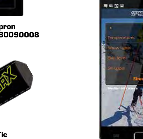
Ski Tie Product No. 80090003