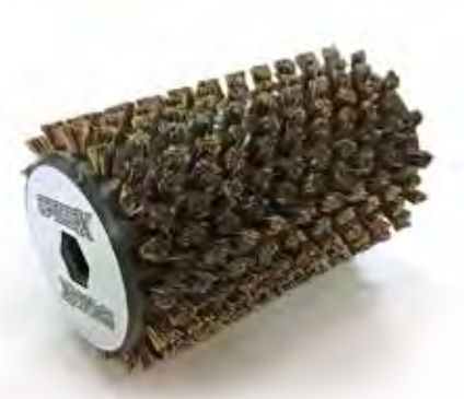
Roto Brush Horse Hair Product No. 70090011