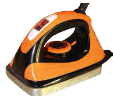
Digital Iron Product No. 70090014