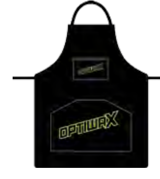
Wax Apron Product No. 80090008