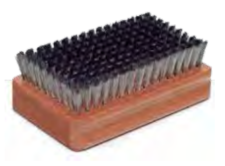
Brush Fine Steel Product No. 70090005