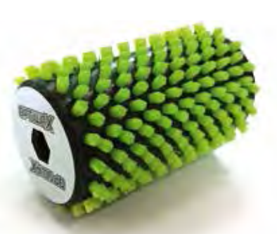
Roto Brush Soft Nylon Product No. 70090009