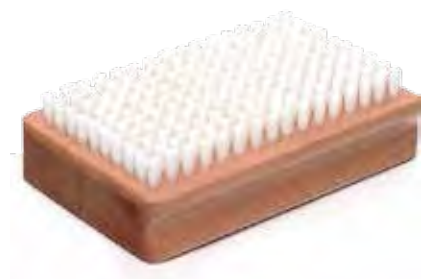
Brush Nylon Product No. 70090002