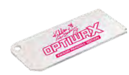
Scraper Kikkan Product No. 71090006