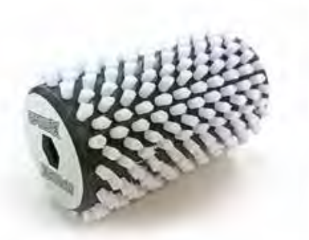
Roto Brush Hard Nylon Product No. 70090010