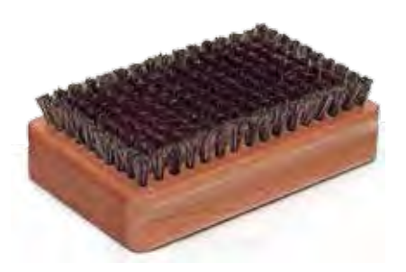
Brush Brass Product No. 70090004