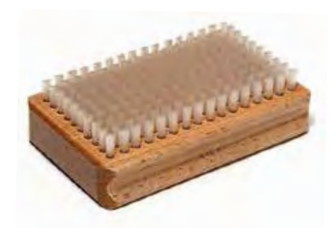
Brush Nylon Hard Product No. 71090001