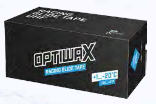
Glide tape UHF wide, 25m | +1...-20°C Big brother for Glide tape UHF Wide, bigger

Width: 120mm, Lenght: 10m Product No 20230101