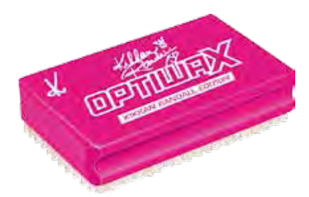
Brush Nylon Hard Kikkan Product No. 71090001